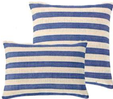
PILLOW TALK Blue striped pillows liven up a seating area, indoors or out. Fresh American Trimaran Stripe Pillows in Denim/Ivory, $48 (24" by 16") and $58 (22" by 22"); dashandalbert.com