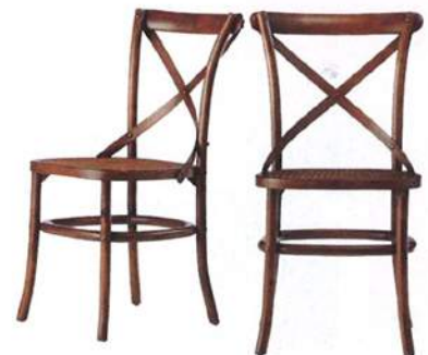
TAKE A SEAT The architectural shape and woven seats add a visual asset to any room. Furniture Classics Bentwood Chairs , $393 for a set of two; hayneedle.com