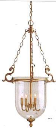
CHAIN REACTION This nautical, chain-link brass pendant makes a perfect dining room accent. Currey & Co. Athena Lantern , $800, Redefined Home Boutique; 404/815-7250