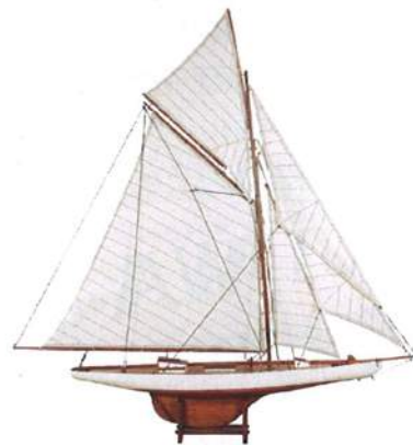
SAIL AWAY A model sailboat is striking and keeps you sea-focused even on land. Frontgate America's Cup Columbia 1901 Boat Model , from $149; frontgate.com