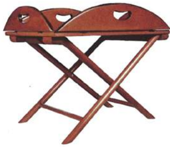
HISTORY LESSON You'll find a conversation starter in this mahogany coffee table and its inlaid compass rose design. Authentic Models British Butler Table , $379; bellacor.com