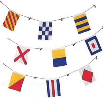
MARINE LIFE These decorative signal flags serve up personality and charm in one fell swoop. Nodical Nautical Flag Banner , $29; landofnod.com