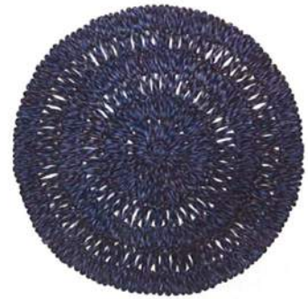
SOMETHING BLUE Your tabletop will get a hit of color and texture with woven place mats. Juliska Straw Loop Place Mat in Navy, $18; juliska.com