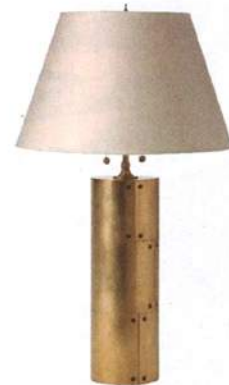
METAL WINNER Covered in sheets of brass, this lamp delivers glamour and an industrial look. Williams-Sonoma Home Riveted Metal Table Lamp , $675; wshome.com